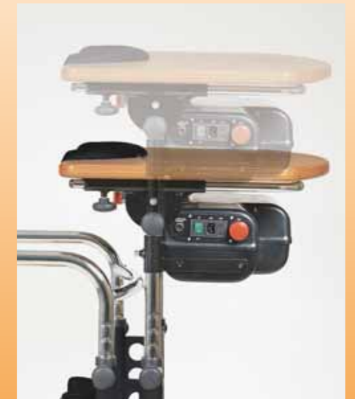
table it is adjustable in backwards-forwards