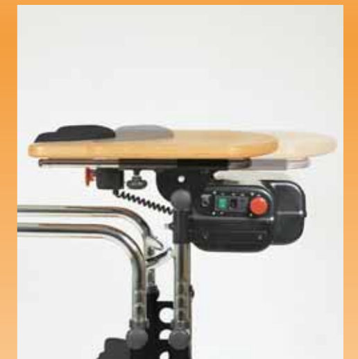
table it is adjustable in tilt (0°-23°)

table it is adjustable in backwards-forwards