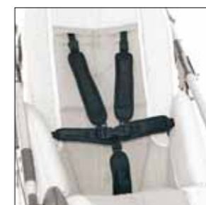
853 VEST HARNESS