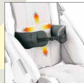
868 SIDE WRAPPABLE and FLEXIBLE SUPPORTS for the trunk. Height and width adjustable