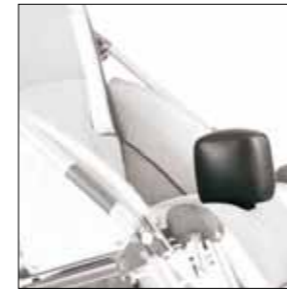
834 ABDUCTION BLOCK