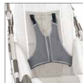
903 FIVE POINT VEST HARNESS