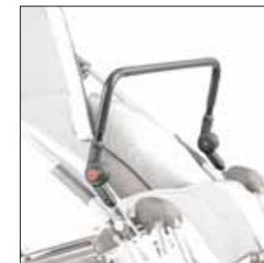
839 FRONT HANDLE