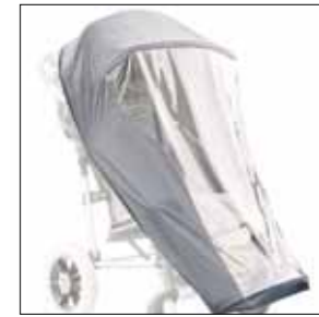
825 RAIN COVER to be fixed to the 819 canopy