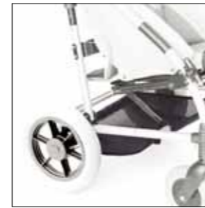
858 MESH BASKET