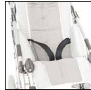
817 INGUINAL STRAPS