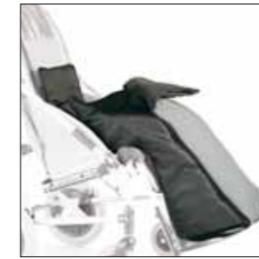
818 THERMAL COVER