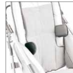
838 PADDED SIDE SUPPORTS