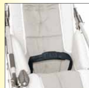
894 45° BELT FOR THE PELVIS