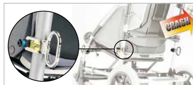
891 SET OF 4 TIE DOWN HOOKS for the forward-facing transport of the pushchair in a motor vehicle (private vans/cars, buses..)