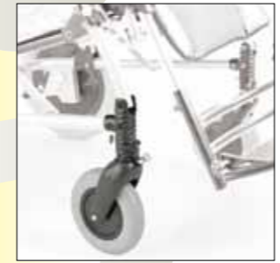
812 WHEEL DIRECTION LOCKS