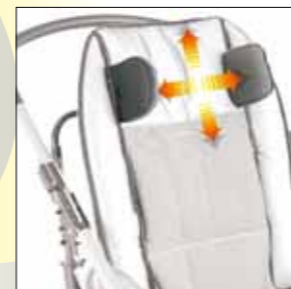
852 HEADREST with Parietal Supports. It is adjustable in height and width