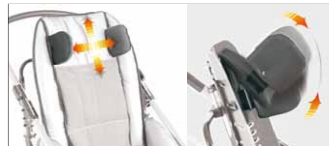
863 HEADREST with Occipital-parietal Supports. It is adjustable in height, in width, in tilt, forwards and backwards