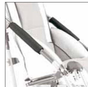
844 SIDE PROTECTING COVERS