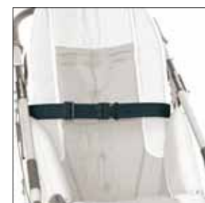
828 CHEST BELT