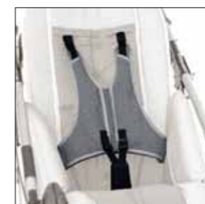
906 FIVE POINT HARNESS